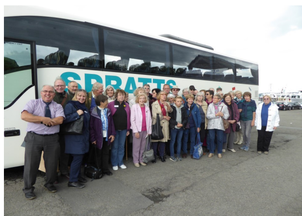
Group photo at Honfleur

The visit to Rouen this year was an enjoyable experience with lots of variety and places of interest.