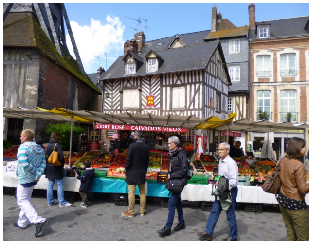
Market stalls Honfleur